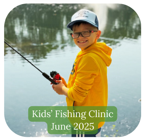
Kids' Fishing Clinic June 2025

We look forward to seeing you at our upcoming activities!